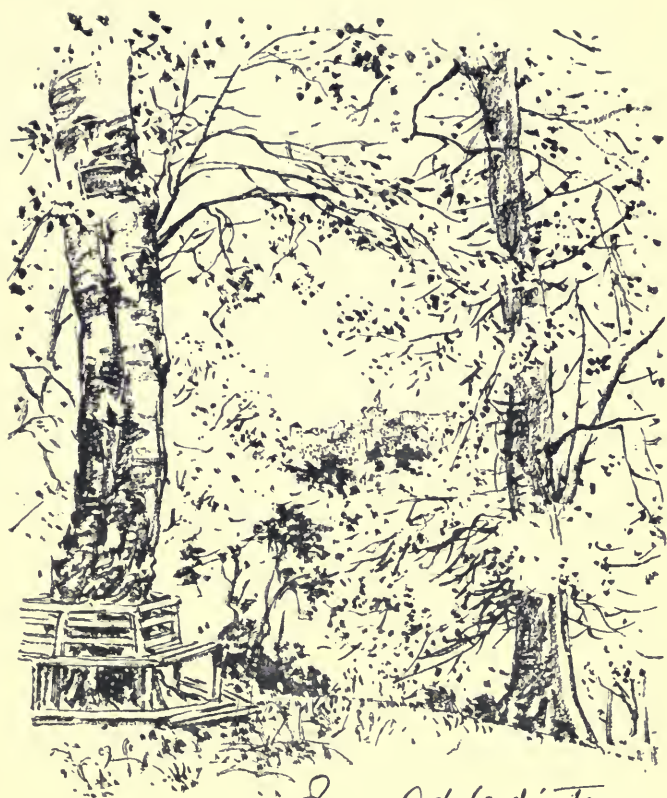
Queen Adelaide's Tree